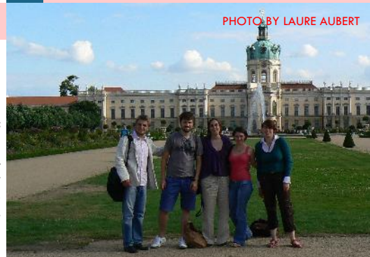
THE EFLA COMMUNICATIONS GROUP IN FRONT OF BERLIN'S CHARLOTTENBURG CASTLE