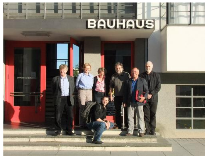
THE EFLA-ECLAS DELEGATION IN FRONT OF THE FAMOUS BAUHAUS ACADEMY BUILDING