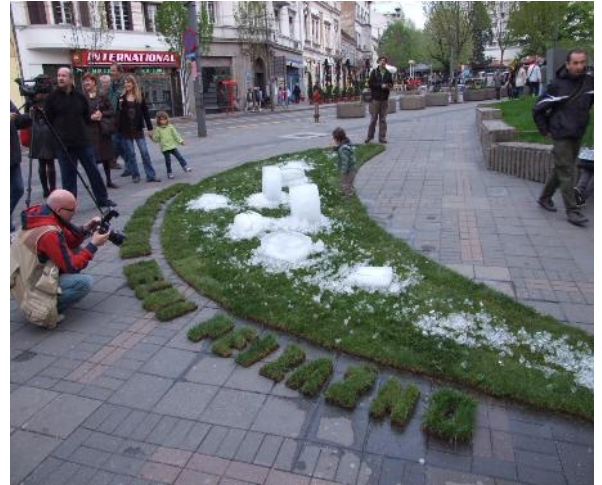
A PICTURE FROM THE EXHIBITION IN THE STREETS OF BELGRADE